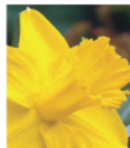
B. King Alfred Daffodils Nothing beats these exceptionally large yellow blooms! Expect more blooms the following season, as this variety multiplies rapidly. Home hang for your hutch! April bloom, 22" tall 6 bulbs $13.00 ☀️ 🌱 🌿