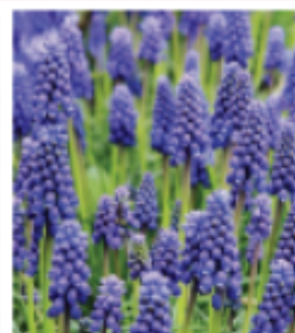
I. Heavenly Blue Bells These rounded bell-shaped clusters of coral blue are ideal for borders, railing, or as plantings with tulips and daffodils. Very hearty and care-free—all thrive for many years. April-May bloom, 4"-6" tall 18 bulbs $13.00 ☀️ 🌱 🌿