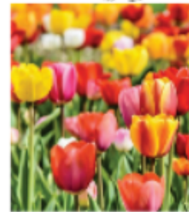
J. Giant Dutch Tulips A stunning colorful display of the most popular solid color and bicolor midseason varieties. These sturdy-stemmed beauties are quite hearty and will flower for years. April-May bloom, 18"-24" tall 8 bulbs $13.00 ☀️ 🌱 🌿