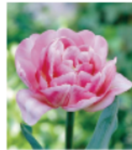
D. Foxtrot Tulips Spring hits the dance floor with this variety! Rose-like shaped petals of soft pink with shimmering white highlights and a darker pink underside add beauty and elegance to any home or garden. You'll absolutely love 'em! Best March-April bloom, 10"-12" tall 6 bulbs $13.00 ☀️ 🌱 🌿