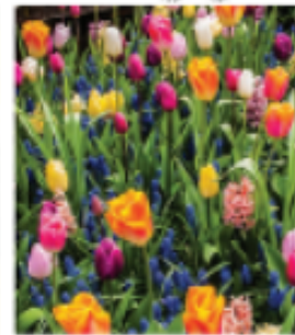
R. "The Works" Here's everything you need for a traditional spring flower garden. Includes an assortment of 15 crocus, 8 tulips, 4 hyacinths, 6 daffodils, 10 bluebells, and 24 alpine bells. April-June bloom, (various heights) 75 bulbs $52.00 ☀️ 🌱 🌿