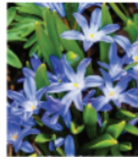
E. Glory Of The Snow These bright blue, very early spring bloomers are sure to delight. Each bulb produces as many as 3 blooms per stem. We suggest combining with Snow Bunch Crocus (item 1) and Heavenly Blue Bells (item 1) for a dazzling display. Great for naturalizing! March bloom, 5" tall 15 bulbs $13.00 ☀️ 🌱 🌿