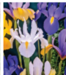
N. Dutch Iris Mix Often referred to as the "beckid" of the iris family, you're sure to enjoy the multicolor bouquet of blooms. Ideal for cutting. June bloom, 18" tall 14 bulbs $13.00 ☀️ 🌱 🌿