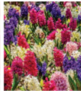
K. Super Color Hyacinths Welcome spring with the sweet fragrance of hyacinths, bright, lasting last colors of red, pink, white and blue. Excellent for accenting perennials and ground covers, and ideal for beds and borders. April bloom, 8"-10" tall 4 bulbs $13.00 ☀️ 🌱 🌿