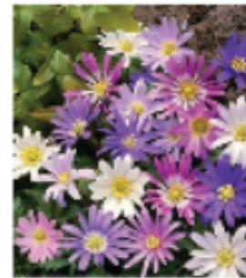
L. Grecian Windflowers Create a floral carpet of continually blooming, daisy-like flowers of blue, white, and pink. Perfect for borders and naturalizing. April bloom, 5" tall 12 bulbs $13.00 ☀️ 🌱 🌿