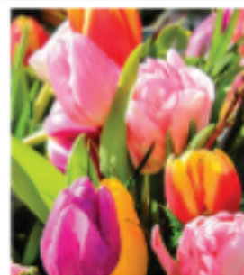
C. Pastel Tulip Mix Paint a masterpiece with these soft colored midseason beauties. Diversify your display by combining with our Heavenly Blue Kells (item 1). April-May bloom, 18"-24" tall 8 bulbs $13.00 ☀️ 🌱 🌿