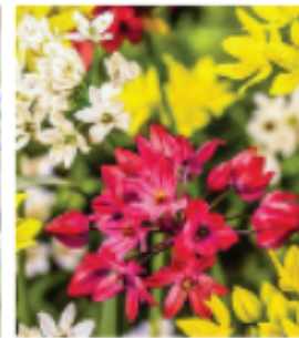
Q. Alpine Bells Assortment Double your pleasure with the beauty and sweet fragrance of these clusters of red, white and yellow blooms. Very tolerant of poor soil conditions. Perfect for both naturalizing and cut flowers. June bloom, 10"-16" tall 24 bulbs $13.00 ☀️ 🌱 🌿