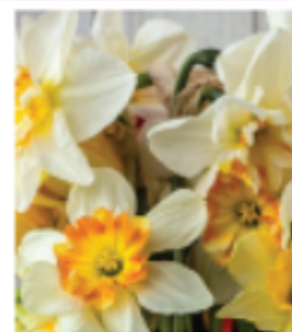
A. Mixed Daffodils Non-stop fun with this beautiful blend of popular large and small cup varieties. Colors range from white and yellow solids to bi-colors of orange, yellow, and red. A stunning combination! April bloom, 18"-22" tall 8 bulbs $13.00 ☀️ 🌱 🌿

INSIDE VIEW ** SAMPLE OF FALL ITEMS ** SEE WEBSITE FOR CURRENT ITEMS