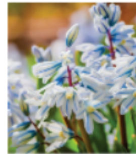
P. Striped Squill Gracefully grow anywhere! Trouble-free! Create a floral carpet of fragrant, striped ice-blue flowers wherever your heart desires. You'll enjoy these year after year. March-April bloom, 4"-6" tall 20 bulbs $13.00 ☀️ 🌱 🌿