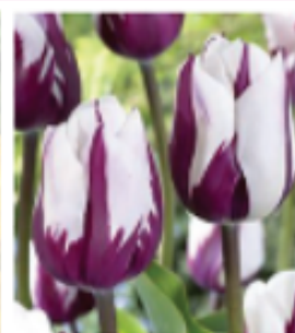
H. Blueberry Ripple Tulip Looking pure white with deep violet-purple, ripples. Each bloom is unusual. Combine with our Healer or Giant Dutch Tulip mix for a "winter color". April-May bloom, 18"-24" tall 8 bulbs $13.00 ☀️ 🌱 🌿