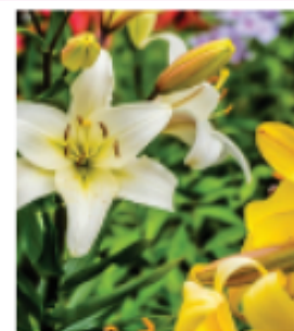
G. New Tiger Lilies Add exotic beauty with these vigorous Asiatic hybrids. Multiple blooms of delicately dotted petals of red, white, yellow and pink. Ideal for non-rotting, perennial borders, and formal plantings. July-September bloom, 2'-4' tall 3 bulbs $13.00 ☀️ 🌱 🌿