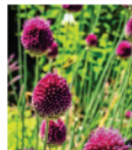
M. Purple Drumsticks Watch these long-lasting, ball-shaped flowers evolve from green to vibrant, crimson purple! This versatile bloom is great for both outdoor accents and indoor bouquets. Can also be dried. May-June bloom, 2'-4" tall 15 bulbs $13.00 ☀️ 🌱 🌿