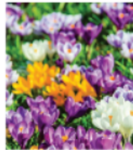
F. Snow Bunch Crocus Spring's right around the corner when these early bloomers arrive. A mixture of vibrant purple, white and yellow that cheer up any flower bed or garden. March bloom, 5" tall 15 bulbs $13.00 ☀️ 🌱 🌿