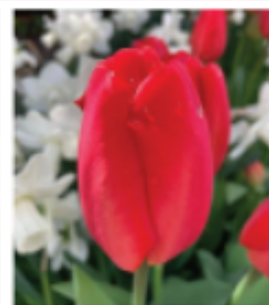
O. Red Parade Tulips A Holland favorite beloved for dependability and exceptionally large, vivid red blooms. Great companion for Heavenly Blue Kells (item 1) or Grecian Windflowers (item 1). An exceptionally reliable perennial! April-May bloom, 22"-24" tall 8 bulbs $13.00 ☀️ 🌱 🌿